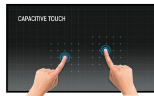
Touch technology - Capacitive

IPS displays are best known for wide viewing angles and natural, highly accurate colours. They are especially suited for colour-critical applications.